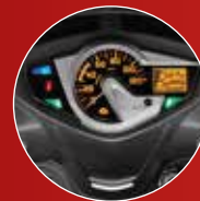
DIGITAL ANALOG COMBO METER