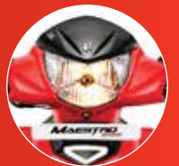
ALWAYS HEADLAMP ON