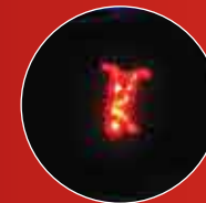
SIDE STAND INDICATOR