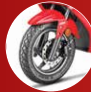
DIAMOND CUT ALLOY WHEELS