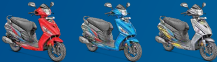
Scarlet Red New